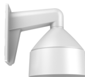
DS-1273ZI-DM26 Wall mount