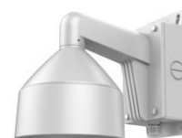
DS-1273ZI-DM26-B Wall mount with junction box