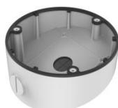
DS-1281ZI-DM26 Inclined ceiling mount