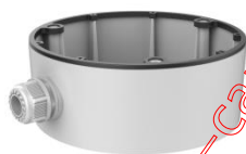
DS-1280ZI-DM26 Junction box